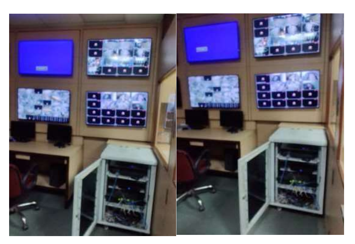
Server Room Camera Control Unit

College campus is in an area surrounded by local communities who are closely related with the institution. It is surrounded by boundary walls of such height, which cannot be scaled over easily. 24x7 hrs security guardson all entrances and gates are available. During college fest and other events, usually local police authorities are informed, and proper assistance can be obtained. Student's discipline and monitoring committee looks after the discipline and law and order insidethe college campus. There are separate hostels with caring and responsive wardens with appropriate security arrangements for boys and girls.