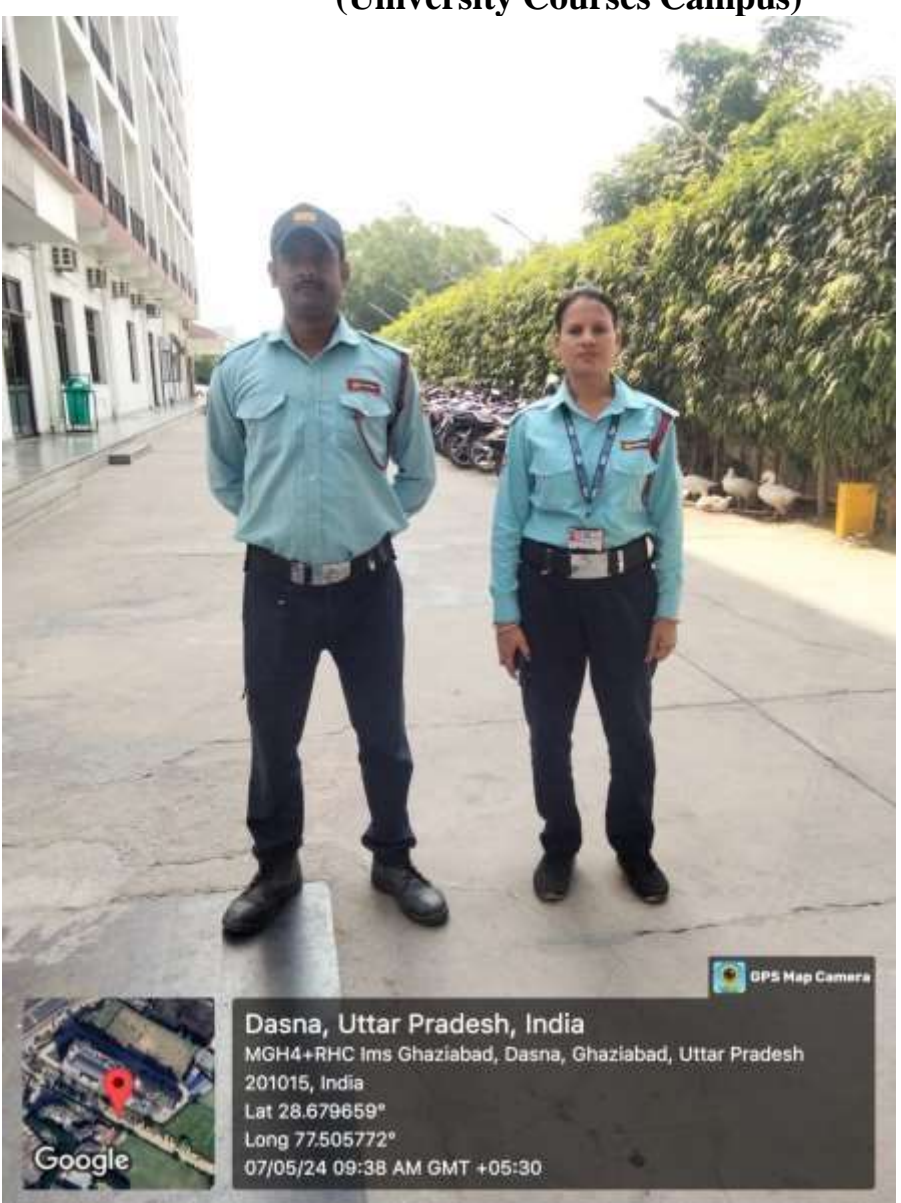
Male & Female Security Guards