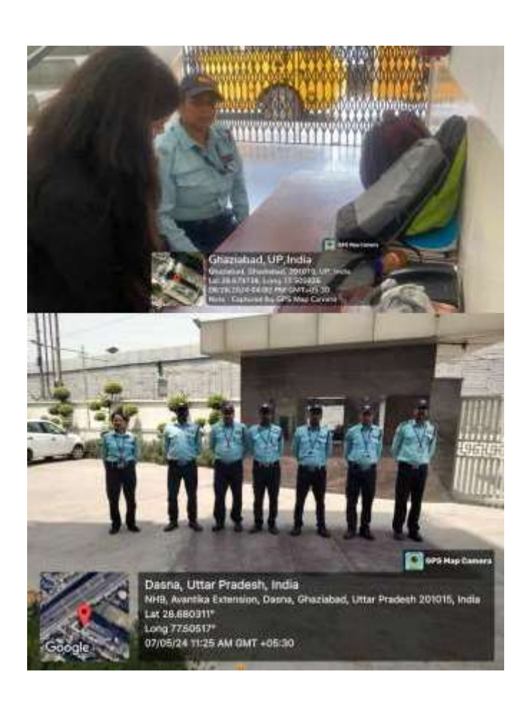
Male & Female Security Guards